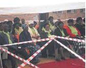
Members of Kodumela, an organisation caring for the aged in Monsterlus came in their numbers to honour this event.